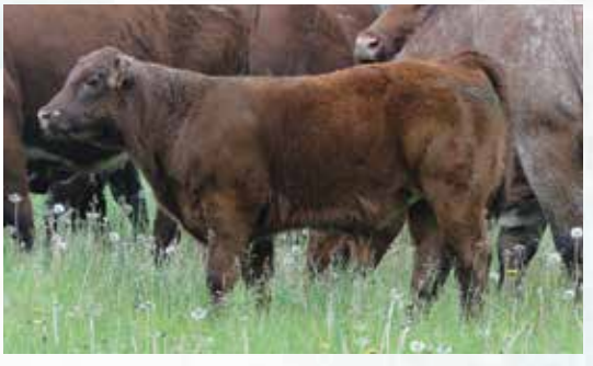
Hatfield Governor 17X bull calf

a son of Mandalong Super Flag are being used on heifers this year.